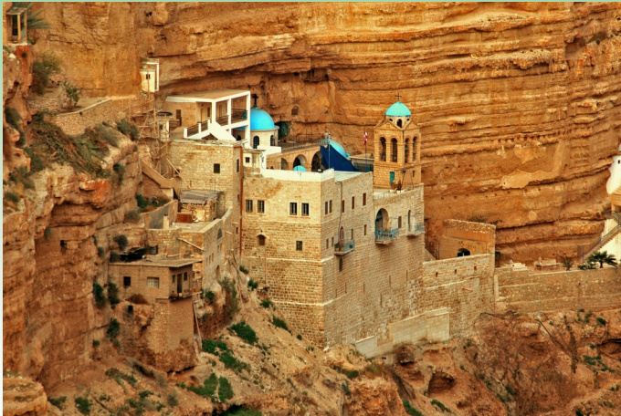
The Monastery of St. George