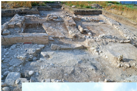
The site of Tell el-Hassan